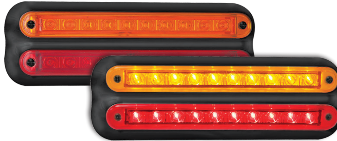
Stop/Tail/Indicator 235BAR12 - Blister, 12 Volt